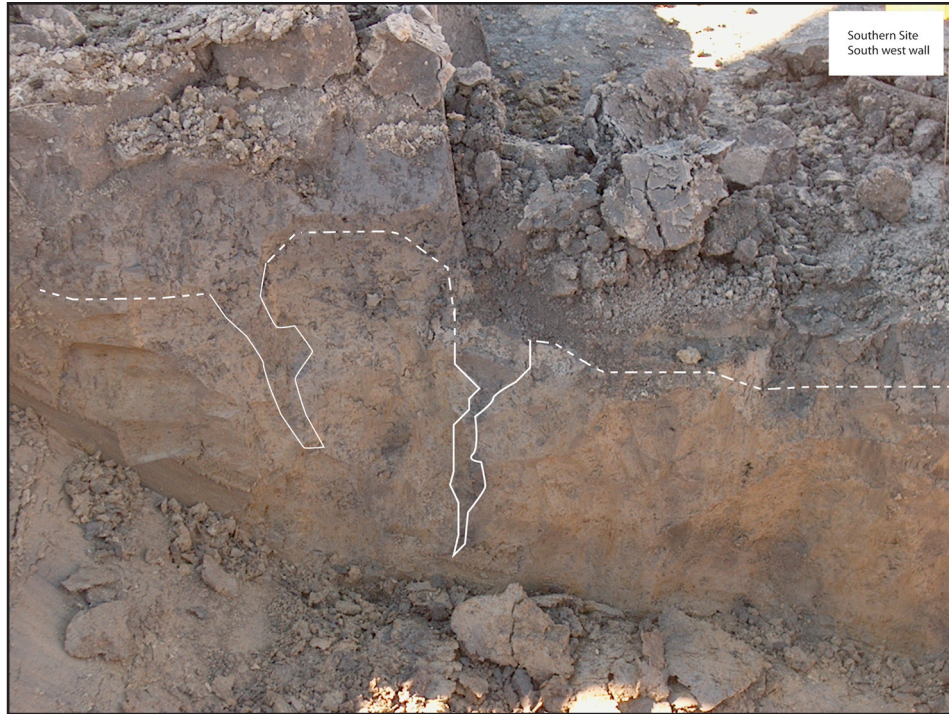
Figure 2-4. Western wall of trench cut across the block excavations at 16IV94. The Hb unit (Saucier 1994b:Plate 11) is represented. The dashed white line divides the overlying gray, interpreted stream infill from the underlying interpreted brown-gray relict, backswamp soil. Note the shape of the former roots that cross into the lower unit. Root-like features are often associated with darker sediment, probably representing zones containing reduced iron compounds.

deposits at this site occur within the channel fill. The mottled reddish brown and gray clay unit below the interpreted channel fill is similar in appearance to the interpreted redoximorphic features of the flood basin backswamp deposits (Hb) noted at 16IV109.