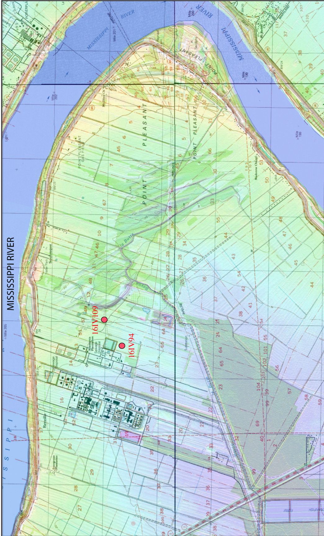
Figure 2-1. Overlay of LiDAR (www.atlas.lsu) and four United States Geological Survey Quadrangle sheets (USGS 1992a-d).